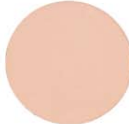
Soft Blush Medium