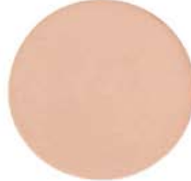
Soft Ivory Medium