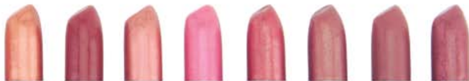
Copper Wine Go Go Retro Tickled Pink Jucy Melon Million $ Mauve Cinnamon Stick Blackberry