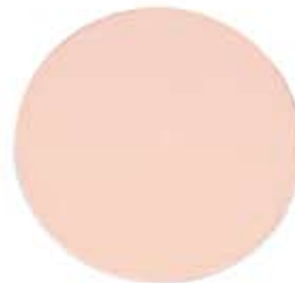
Soft Blush Light