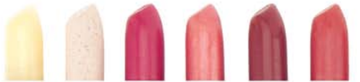
Vitamin E Lip Exfoliate Borage Opium Kola Cabernet