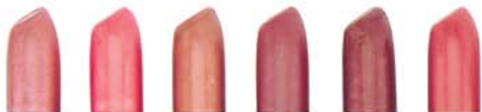
Zinfandel Crystal Rose Maple Brown Sugar Cocoa Ice Passion