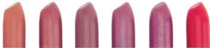
Cafe Latte Sangria Cognac Lilac Raspberry Tiffany Red