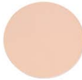
Soft Ivory Light